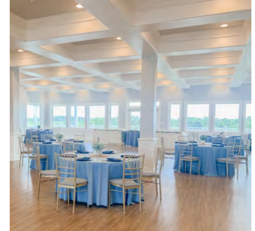
VISIT OUR WEBSITE FOR MORE PHOTOS | WWW.BRICKLANDINGVENUE.COM