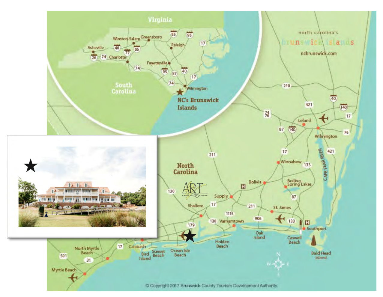
The Perfect Location for Weddings & Events

Our passion is working closely with each client so they may host their event and enjoy time with their guests while we manage behind the scenes dining details.